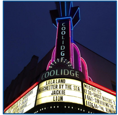
Coolidge Corner Theater

This is a receiver worn casually on your hip or held in the hand. It also can come with a lanyard that acts as an induction loop. The Coolidge has reduced the size and improved the sound quality of the device and headphones (or neck-loop). Nick has also added two in-house microphones in the larger movie houses, one and two, so that live movie introductions and post-show discussions are more audible and now run through the system into the devices.