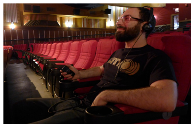
Assistive Listening/Audio Descriptive Receivers with Headset